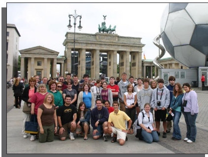
German group at Brandenburg Gate, Berlin