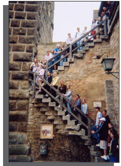
A German group poses at the City Wall in Rothenburg.